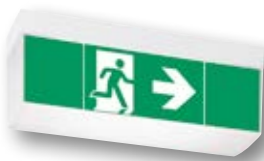
51021 CG-S with pictogram foil PR